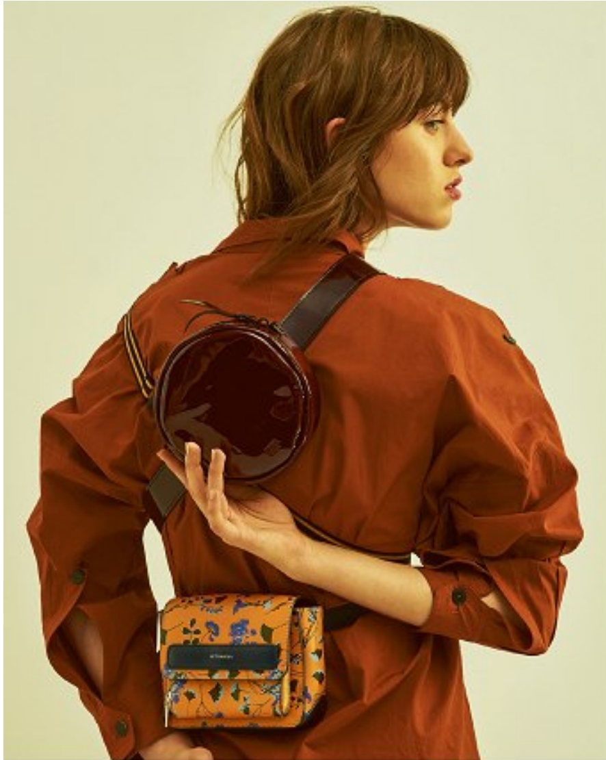
sac-ceinture en cuir verni, Darris. Pochette-ceinture en cuir de vachette, Le Tanneur. Coupe-vent en Nylon, K-Way. tunique en coton, Morigo.