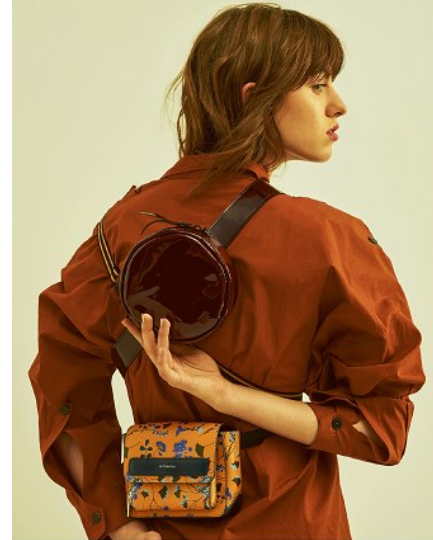
sac-cinture en cuir verni, Darris. Pochette-cinture en cuir de vachette, Le Timneur, Coupe-vent en Nylon, Kikky, lunique en coton, Mergo.