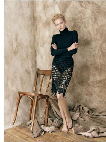
Job GATEL / STYLE'S OWN